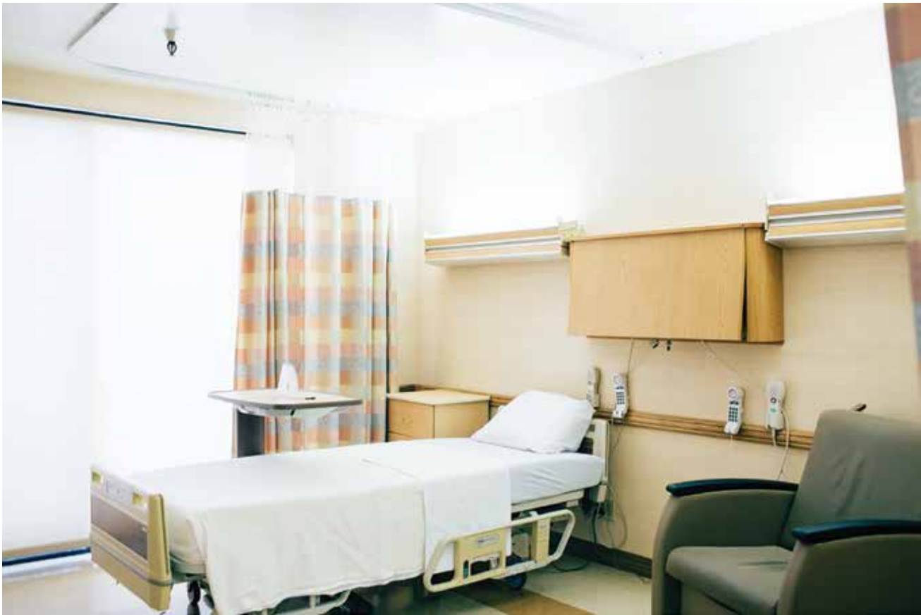
(LDR Room. Labor, Delivery, and Recovery Room)

Mother-Baby Suites: Our suites support rooming-in 24 hours a day to promote mother-baby bonding and breastfeeding. This gives you an opportunity to get to know your baby in an intimate, nurturing environment with one Couplet Care nurse who cares for both you and your baby.